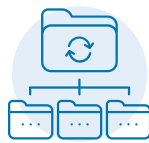
eTMF & Tech Solutions