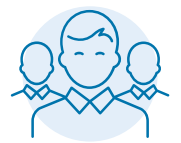
TMF Staffing Solutions

Get the TMF expertise and resources you need to stay inspection-ready.